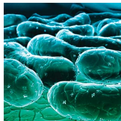
E coli and other bacteria and contaminants