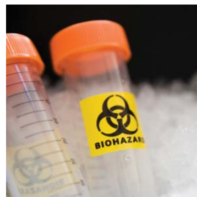
Biological agents including Anthrax and Cryptosporidium